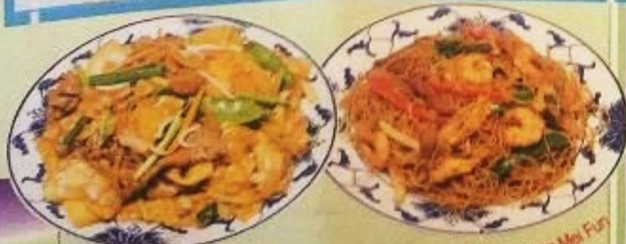
Beef Chow Fun