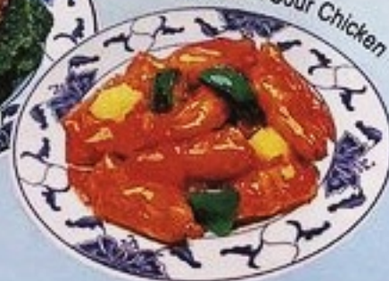
Sweet & Sour Chicken