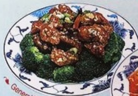
♡ General Tso's Chicken