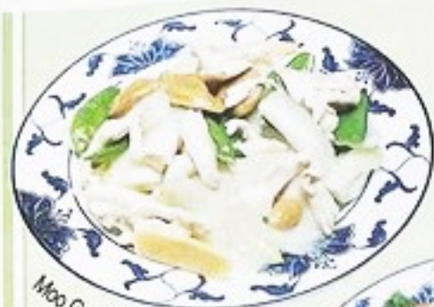
Moo Goo Gai Pan