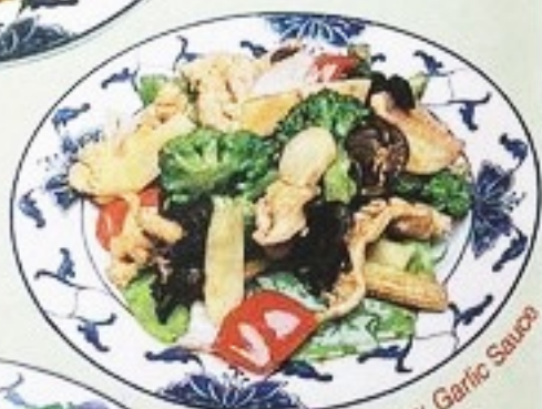
♡ Chicken w. Garlic Sauce