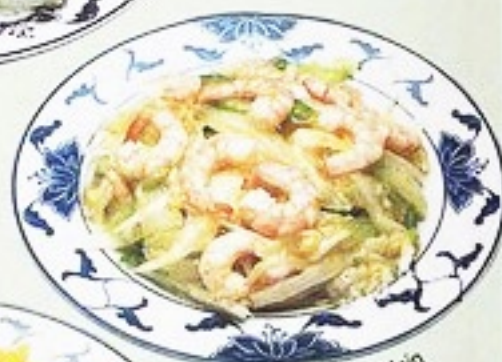
Shrimp Chow Mein