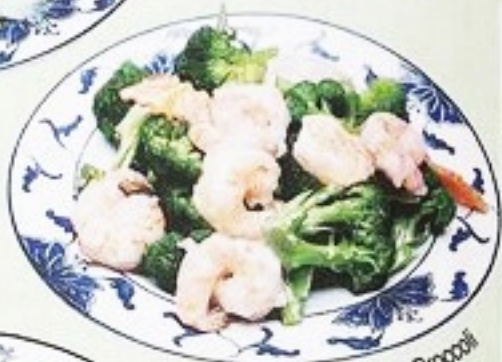
Shrimp w. Broccoli