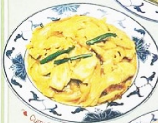
♡ Curry Chicken